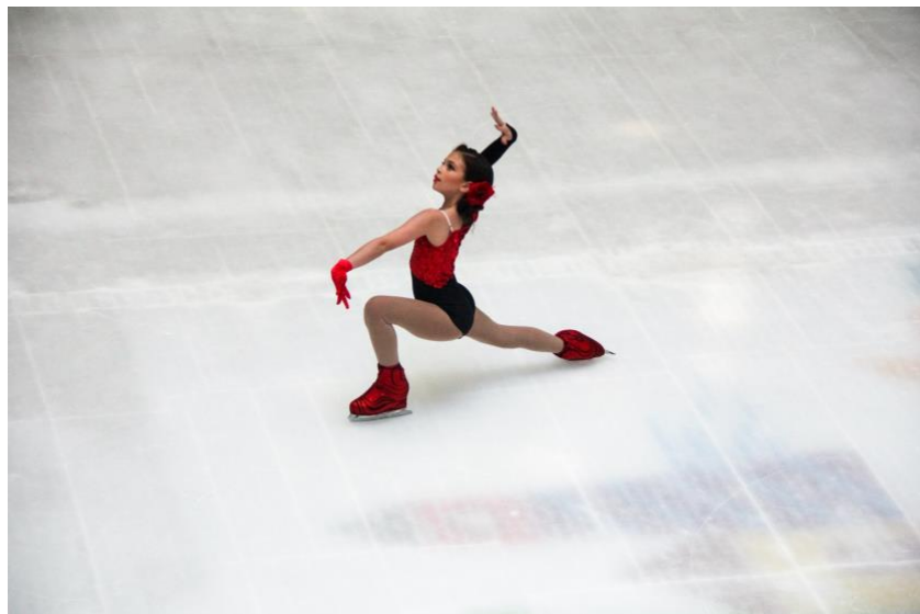
Fig 2: An example of the competitor at the center of the frame.